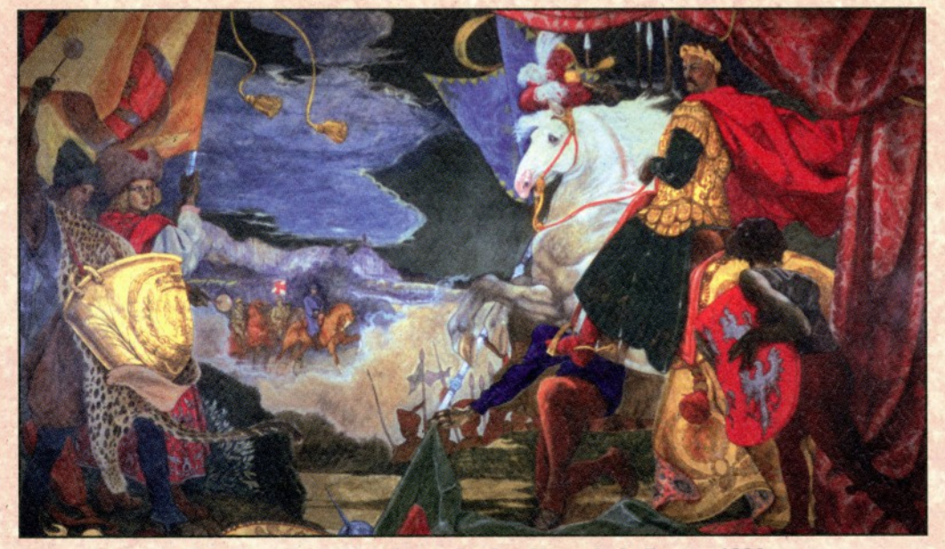
The Glory of Polish Arms, by Jan Henryk de Rosen, 1938

he Polish state was wiped out of the map of Europe after the Third Partition in 1795. The three Partitions of Poland (1772, 1793, 1795) divided the Polish Kingdom among its three powerful neighbors - Russia, Austria, and Prussia. The opportunities for regaining independence emerged only at the end of the World War I, when the three conquerors were defeated. The first to collapse was Russia, unprepared for