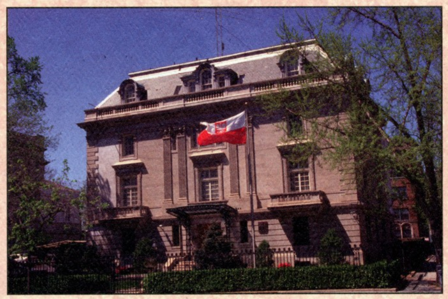
Soon after Poland regained her independence, in 1919, the first Polish envoy to the United States, Prince Kazimierz Lubomirski, purchased the property on behalf of the Polish Government. Only a few changes have been made to the building throughout the years. The main rooms look today just as they did in the 1911 photographs, with the exception of some minor changes in lighting and wall coloring.

he 11th of November is a special date for Poles. It is celebrated as the Independence Day — commemorating Poland's return to the map of sovereign European states after 123 years of foreign rule. This special date, however, marks a series of important events that gave the day a symbolic meaning: long and bloody World War I had come to an end; most of German troops deployed in Warsaw since August 5, 1915, were disarmed; Jozef PILSUDSKI, the architect and leader of the Polish Legions, one of the most esteemed politicians of the time, began talks on taking over power and re-creating the Polish state 'from scratch.'