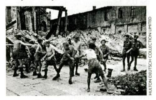
During the first ten postwar years, there was scarcely an adult or youth who didn't participate one way or another: sweeping, digging or passing bricks.

Warsaw's Golgotha began during a 28-day siege by the German Army in 1939, when shelling and bombing killed 40,000 civilians and 6,000 soldiers and flattened about 15 percent of the city, notably burning out its equivalent of Buckingham Palace or the White House: the Royal Castle where Sigismund III and his successors had lived since the 17th century. That, however, was only the first step. During the five-year occupation that followed, the