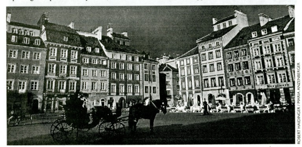
He marched me across the Market Square, past narrow-shouldered 17th-century buildings, to the turreted barbican and brick walls of the old city's ramparts.

and the municipal archives met the same fate, as did the 300,000 volumes remaining in the public library. The Royal Castle, although burned out and roofless, was still standing. Carefully, with all the skill of the excellent engineers they have always been, the Germans drilled 10,000 holes in the walls for dynamite charges. At detonation, the walls dropped like a curtain, neatly