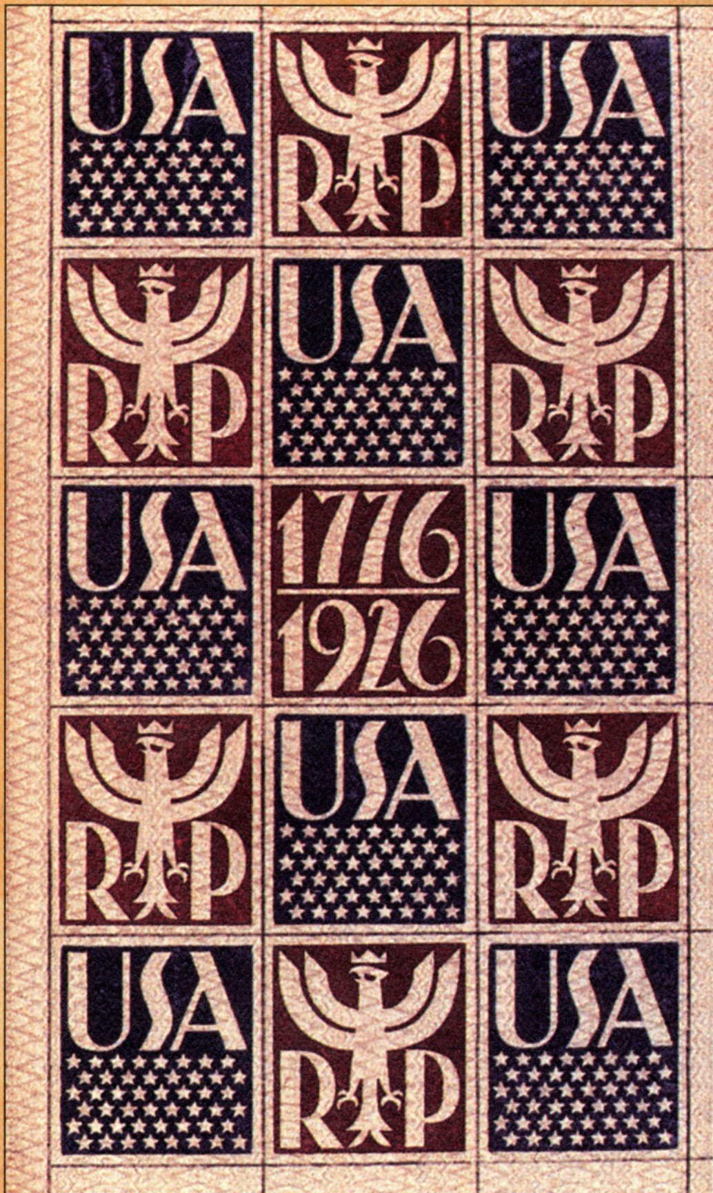
Linen binding designed by Wojciech Jastrzebowski and Bonawentura Lenart. 13-5/8 x 21 in.

The Embassy of the Republic of Poland 2640 16th Street, NW Washington, DC 20009