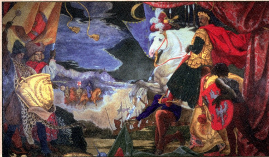
The Glory of Polish Arms, by Jan Henryk de Rosen, 1938

Soon after Poland regained her independence, in 1919, the first Polish envoy to the United States, Prince Kazimierz Lubomirski, purchased the property on behalf of the Polish Government. Only a few changes have been made to the building throughout the years. The main rooms look today just as they did in the 1911 photographs, with the exception of some minor changes in lighting and wall coloring.