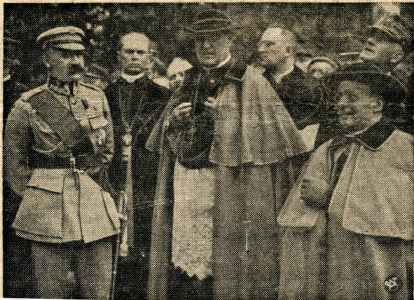
J. PILSUDSKI, to the right of the papal emissary -cardinal Ratti, (future Pope Pius XI.)