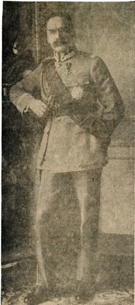
Marshal Piłsudski after after the successful campaign against Russia in 1920