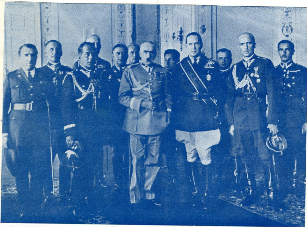
In 1932 Gen. DOUGLAS MAC ARTHUR Chief of Staff of the UNITED STATES Army visited POLAND. This photograph shows General in company of MARCHALL PILSUDSKI and other members of the Polish army staff in BELVEDERE-WARSAW.