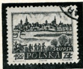
Church of St. Jacek Slupsk

The city of Gdansk (Danzig), on the Baltic Sea, was already a very important stronghold of the Polish rulers in the 10th century. Influenced by the German dukes of the West, Gdansk had been partly germanized, especially when it was taken and occupied by the Knights of the Teutonic Order in 1308. During the 13-Year War (1456-1466) Gdansk was the main cause of the conflict between Poland and the Order. It became a part of Polish territory in 1466 and remained as such until 1772, at which time it was incorporated by Prussia as a result of the first partition of Poland (see also COROS Chronicle no. 88).