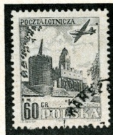
St. Jacob's Church Paczkow