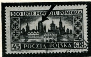
St. Mary's Church Gdansk