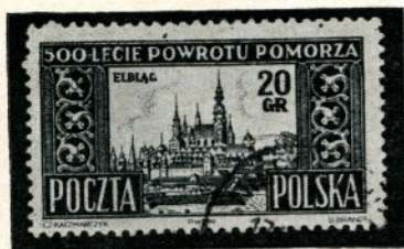
Church of St. Nicholas Elblag