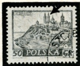
Cathedral of Our Lady Plock

Slupsk lies also in Pomerania on the main track Szczecin (Stettin) to Gdansk (Danzig) and shared the same fate as the whole Pomeranian territory, having in its history several different landlords. It had belonged to the Polish Kingdom in the early centuries of the existence of the country and in 1945 came back to Poland again.